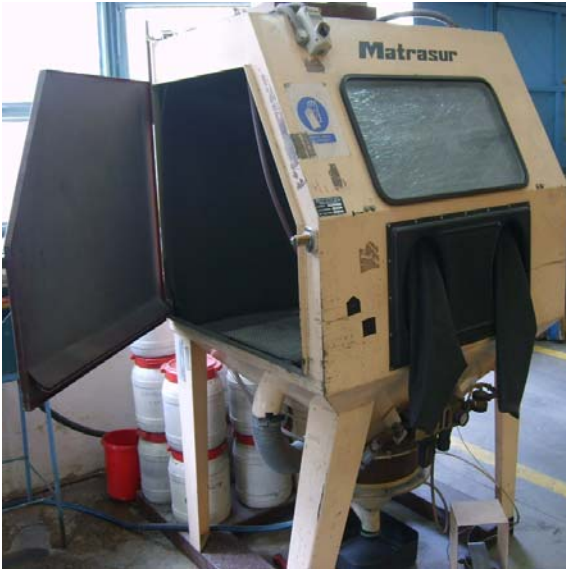
Fig.4. Example of sandblasting machine from the mold workshop

The phases necessary for sand blasting operation are: