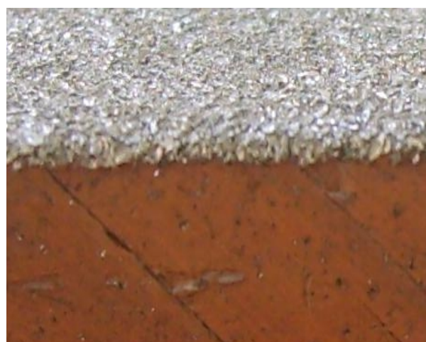
Fig.3. Example of roughness after sand blasting

Function of these parameters the roughness of the cavities surface can be varying from 400µm to 10µm. (Fig.3.).