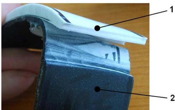
Fig.1. Example of no adhesion between the two components of an injection bi-components plastic part

One of the most important characteristic of an injection bi-components plastic part is the adhesion between the two components. Why is this characteristic the most important? Because, all the injection molding bi-component parts needs to be absolute inseparable all of his life time. This made the difference between an assembly part from two different plastics parts components and an injection molding bi-components plastic part.